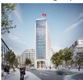
Springer Quartier Hamburg