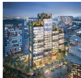
UNIQ Towers Düsseldorf