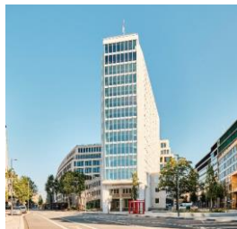
Springer Quartier Hamburg